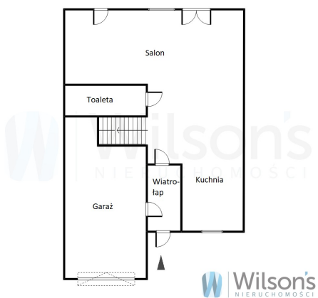
POGLĄDOWY PLAN NIERUCHOMOŚCI- PARTER